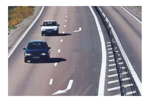
Figure 3. Road with a wire rope median guard rail to avoid head-on collisions.

The basic concept of this approach is that the speeds illustrated in figure 2 representing a safe speed limit. This illustrates a division of responsibilities between the vehicles and the infrastructure. For the case of head-on collisions this means that below the speed that will be eventually agreed upon, in this example set to 80 km/h, the car will be responsible and the infrastructure design will be responsible for safety above this speed. Any road where it is normally possible to drive above 80 km/h will need to be equipped with measures to avoid frontal-collisions. In the case in the figure 3 this is done by using a wire rope median divider making head-on collisions virtually impossible.